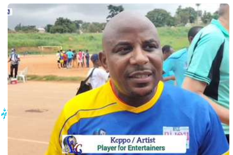
Koppo / Artist Player for Entertainers