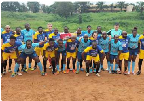
Solidarity Gala Match with Influencers and Community