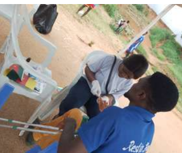
Free medical test, consultation and first Aid