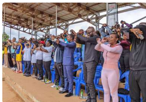
Moments of Civic Education