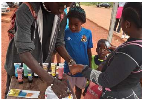
Street Arts and painting